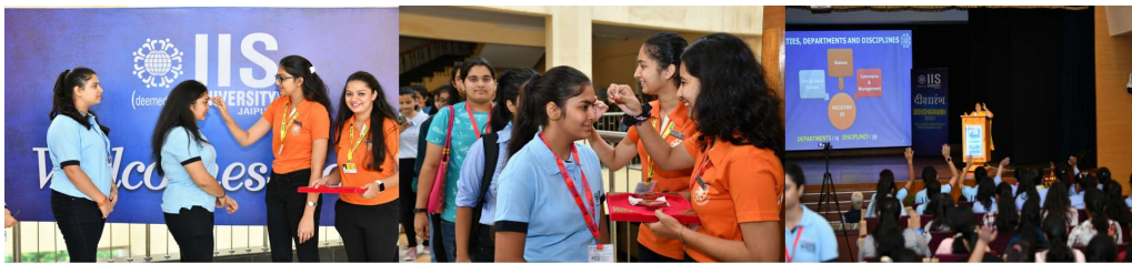
Student Induction Programme (SIP 2022)

The University’s annual Orientation programme was organized for the new entrants on 24-25 August 2022 for UG and PG to acquaint the fresh batch of students with the institutional profile and campus environment. There were talks and presentations by experts from various fields to address the new students on the challenges posed by higher education today and how best to overcome them. There were also faculty-led sessions in which the students were briefed on the university’s infrastructure, facilities, faculty profile, the institution’s day to day operations, curricula and the examination scheme.