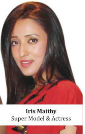
Iris Maithy Super Model & Actress

We along with many other super models will showcase your creativity on runway. Renowned Fashion Designers and Fashion Stylist from Bollywood will judge your talent.