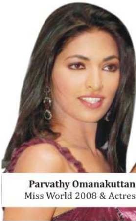
Parvathy Omanakuttan Miss World 2008 & Actress