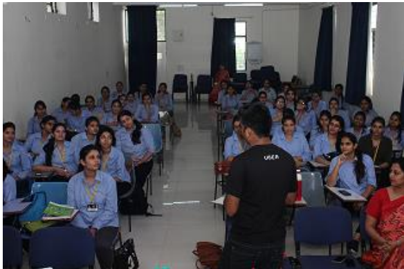
UBER Jaipur Team explaining their marketing strategies

The cell believes that the industry interaction sessions play an important role in grooming students for employability. An insight of the current scenario in the corporate world brings to them, the challenges ahead and the opportunities to convert. Prominent personalities from different industries are invited in the college for these sessions.