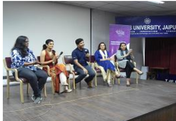
Panel Discussion on Women Entrepreneur