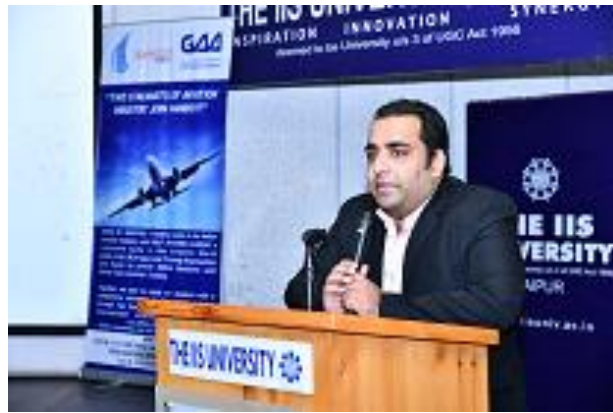
“Career in Aviation Sector”