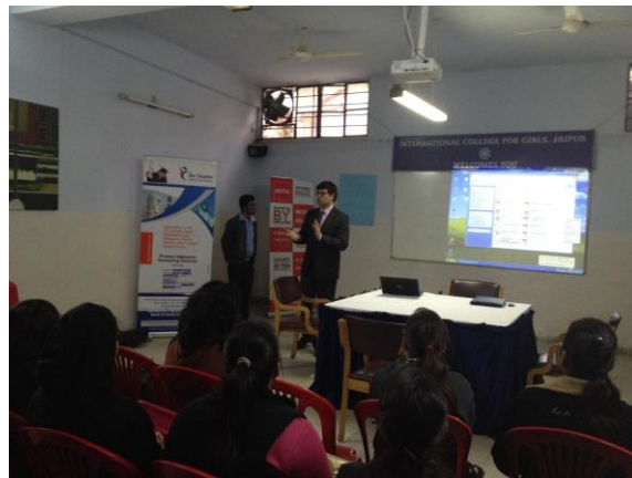
“Higher Education in International Education”