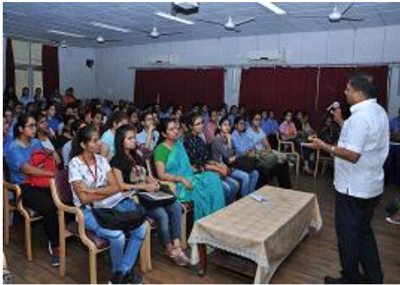
“Career in Management by T.I.M.E.”