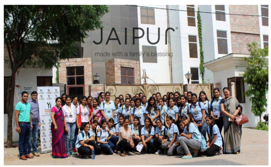
At Jaipur Rugs

Students explored new ways and methods of running a business and also the qualities of leadership.