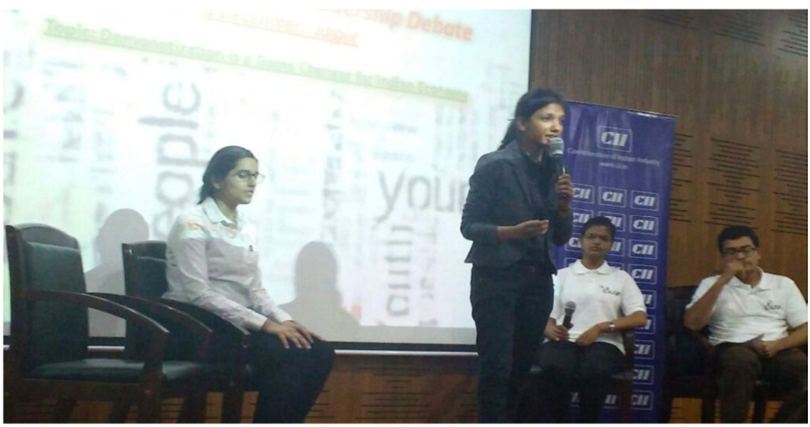
Nukkad Natak 20th January

The activity ultimately enlightened the students and helped them to understand better the implications of the scheme.