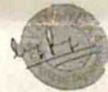
UTKARSH PUROHIT HEAD-HUMAN RESOURCES VIDENDAA